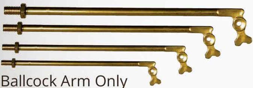
Ballcock Arm Only