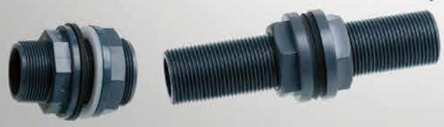
Tank Connectors (See Tank Connector leaflet for more info)