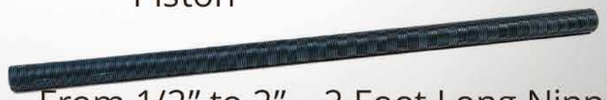
From 1/2" to 2" 2 Foot Long Nipple