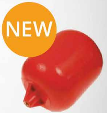
4 1/2" Cylindrical Float for 1/2" and 3/4" Ballcocks