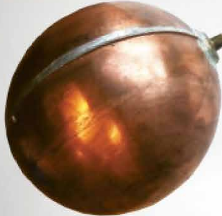
12" Copper Float