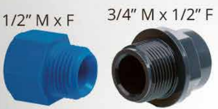
1/2" Brass Ballcock Extensions