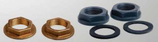
Backnuts & Gaskets